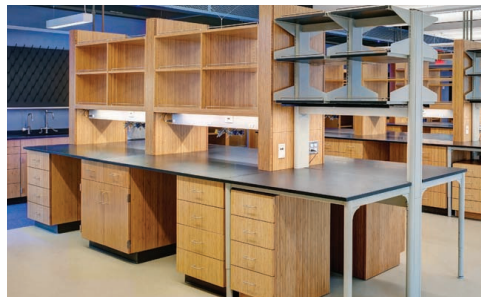
Caramelized Bamboo with edge grain island benches outfitted with electrical, plumbing and task lighting incorporated with moveable and flexible Optima™ Bench systems.