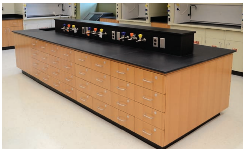
Quarter cut, slip matched European Steamed Beech fixed island benches with raised service cores, providing plumbing and electrical services.