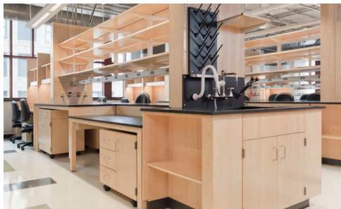
Custom plain sliced Maple research benches with add-a-drawer mobile cabinets, height adjustable tables and write-up work stations. The lab benches are comprised of a fixed overhead system with adjustable shelves, electrical raceways and plumbing fixtures for plug and play convenience.

Everybody's needs are unique; Mott can design and manufacture to meet your exact requirements. We have the expertise to provide solutions to meet your demands, simply contact us with your needs.