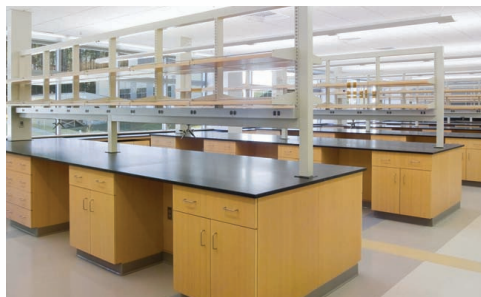
Natural Bamboo wood benches and powder coated steel reagent system with adjustable shelving, electrical raceways and plumbing fixtures.